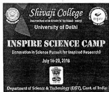
DST Inspire Science Camp.jpg 152K